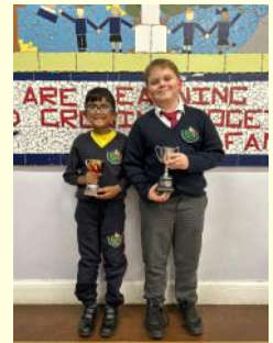
Stas 5R Zion 2R