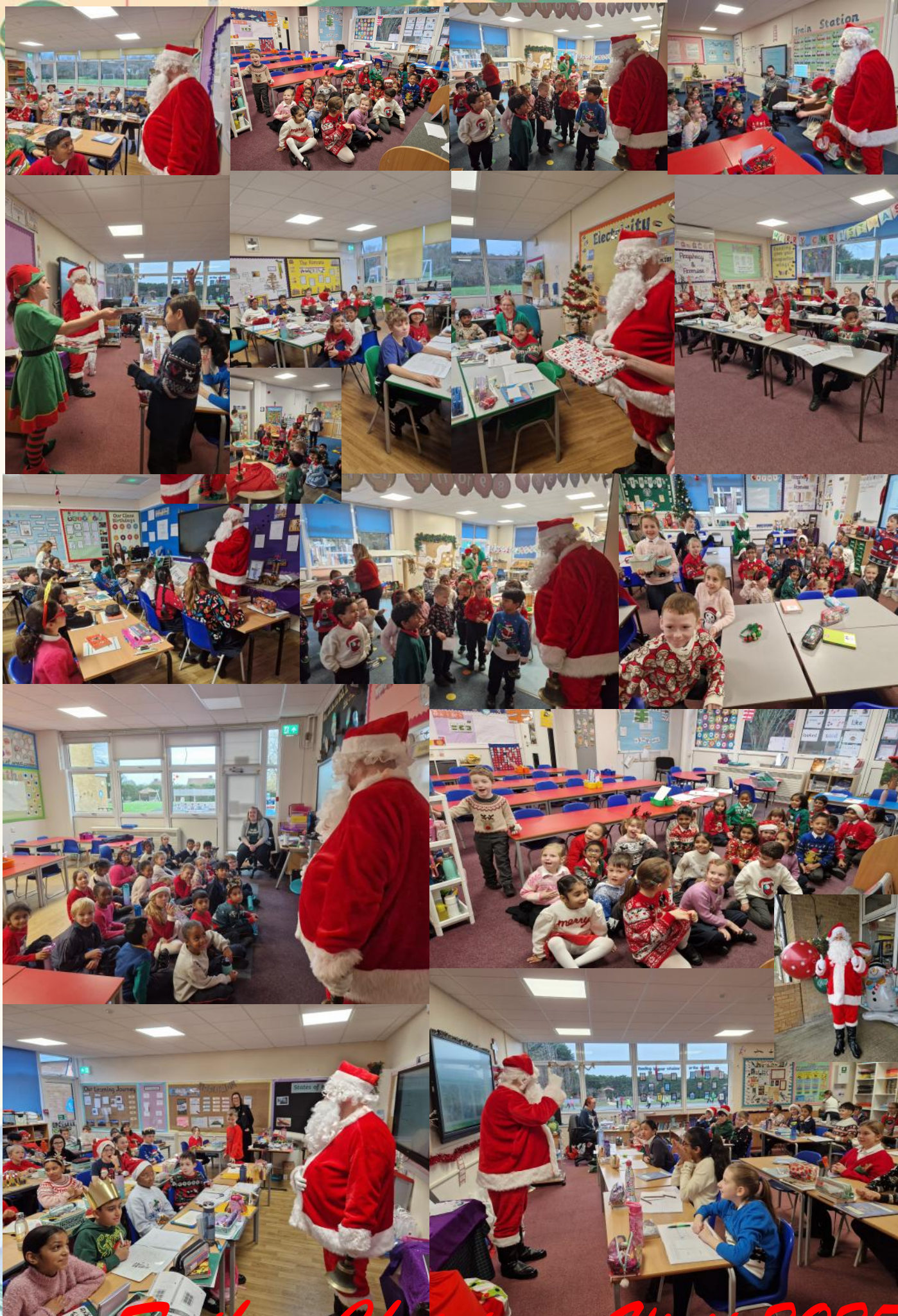
Father Christmas Visit 2025