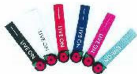
Zip pull - Suggested Donation: 50p