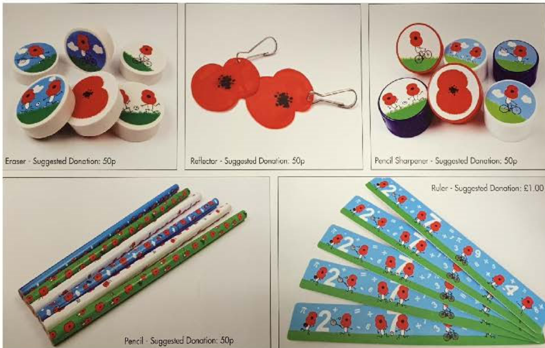
Eraser - Suggested Donation: 50p