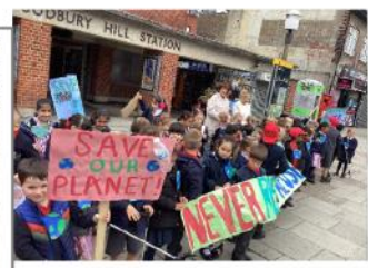
Laudato Si Week 2024