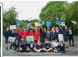
Laudato Si Week 2024