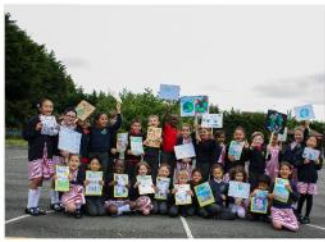
Laudato Si Week 2024