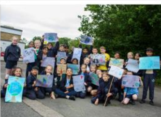
Laudato Si Week 2024