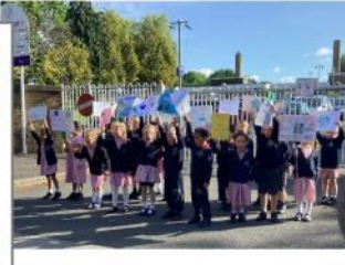
Laudato Si' Week 2024