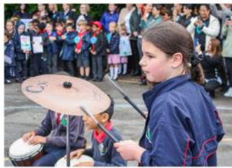
Laudato Si Week 2024