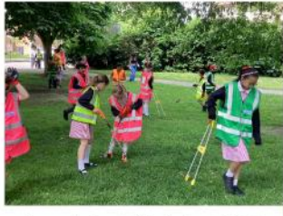
Laudato Si' Week 2024