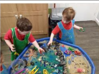
Laudato Si' Week 2024