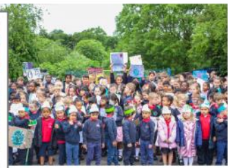
Laudato Si Week 2024