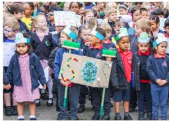
Laudato Si Week 2024