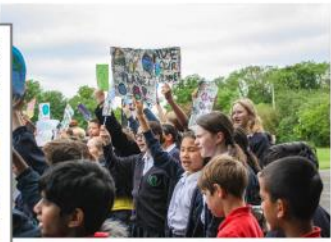
Laudato Si Week 2024