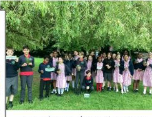
Laudato Si' Week 2024