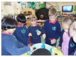
Laudato Si' Week 2024