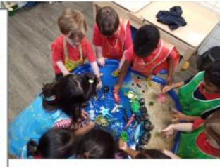
Laudato Si' Week 2024