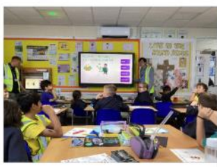
Laudato Si' Week 2024