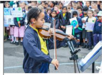
Laudato Si Week 2024