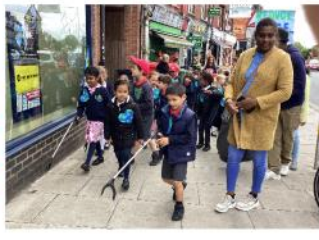
Laudato Si' Week 2024