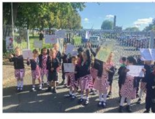
Laudato Si' Week 2024