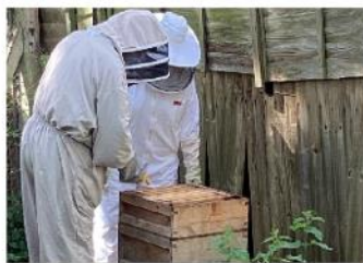
Laudato Si Week 2024