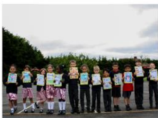
Laudato Si Week 2024