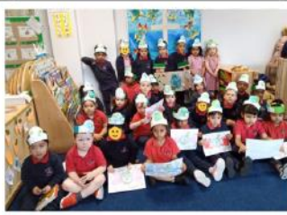
Laudato Si' Week 2024