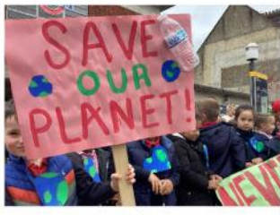
Laudato Si' Week 2024