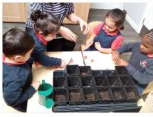
Laudato Si' Week 2024