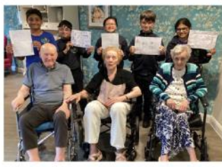
Laudato Si' Week 2024