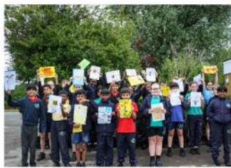
Laudato Si Week 2024