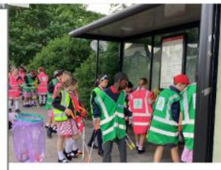
Laudato Si' Week 2024