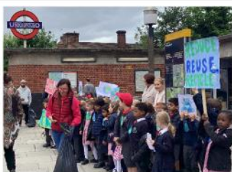
Laudato Si Week 2024