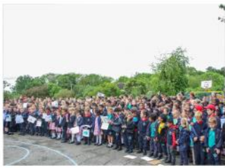
Laudato Si Week 2024