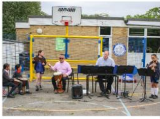
Laudato Si Week 2024