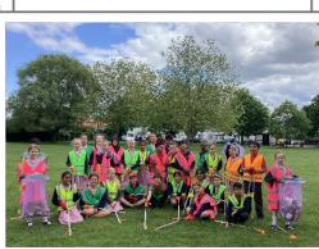
Laudato Si' Week 2024