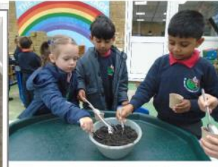
Laudato Si' Week 2024