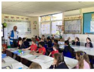
Laudato Si' Week 2024