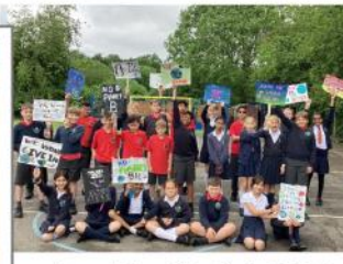
Laudato Si' Week 2024